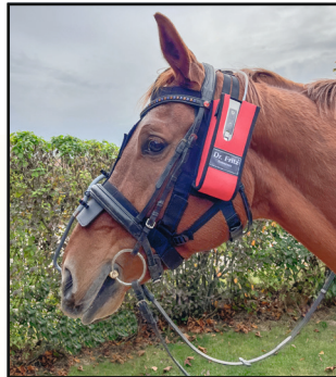
Right side - flushing pump

NextGen4 dynamic and overground endoscopy