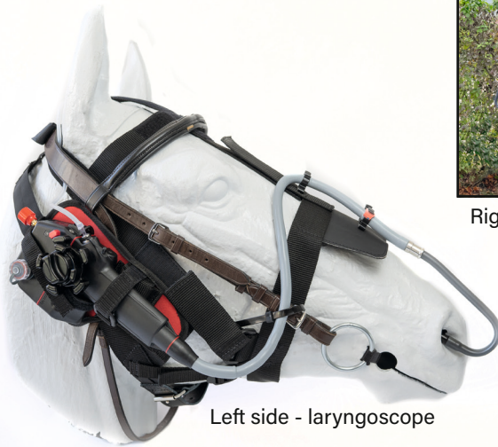
Left side - laryngoscope